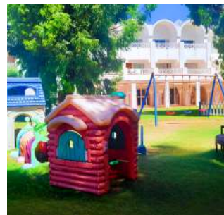
Vic Kids Club