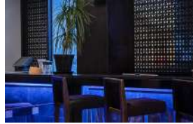
Bar El Kebir