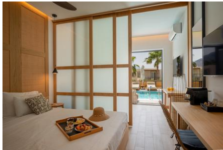
JuniorSuite (Shared Pool)

Lat: 35.352542334841964 Lng: 24.286499900183117