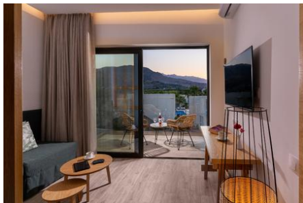
JuniorSuite (Reduced Mobility)