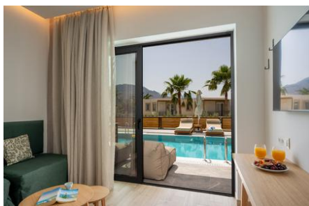
JuniorSuite (Shared Pool)