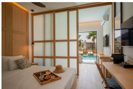
JuniorSuite (Shared Pool)