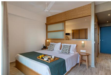
Deluxe Suite (SeaView, Private-PoolTerrace)