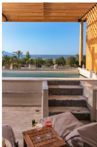
Deluxe Suite (SeaView, Private-PoolTerrace)