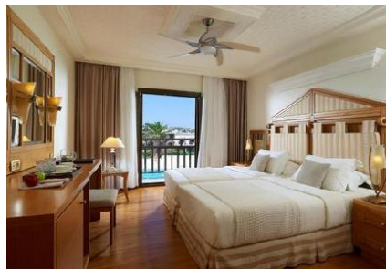
Standard Maisonette (Shared-PoolTerrace)