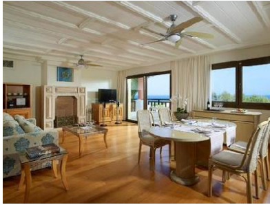
3 Bedroom Imperial Villa