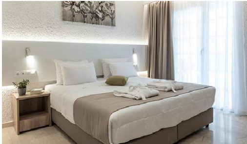
Double Deluxe Room

Tax Payable Locally type: eco tax Currency: EUR charge cycle: per Room per Night 01.01.2024