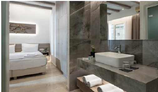
Double Deluxe Room