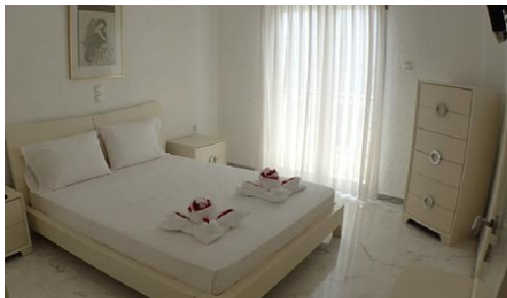
GrandDeluxe Suite (SeaFront)