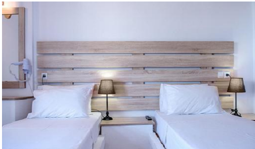
2 Bedroom FamilyRoom