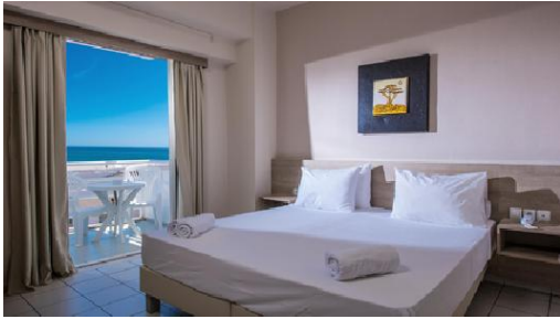
Double Deluxe Room (SeaView)

Lat: 35.31096278194868 Lng: 25.400989348737827