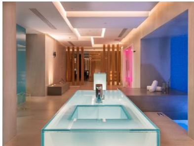
Spa and wellness