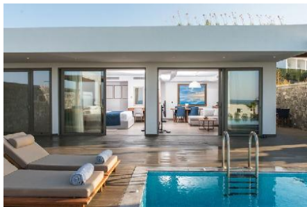
Princess Luxury Villa