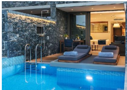
Deluxe Junior Suite