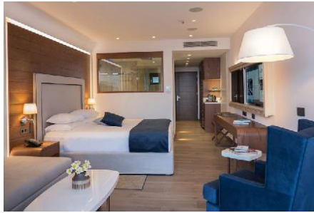
Deluxe Junior Suite

Lat: 35.30334268244559 Lng: 25.41858473318704