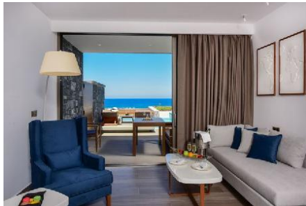
Deluxe Junior Suite