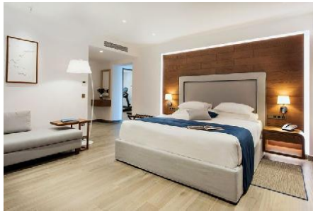
Executive Fitness Suite

Lat: 35.30334268244559 Lng: 25.41858473318704