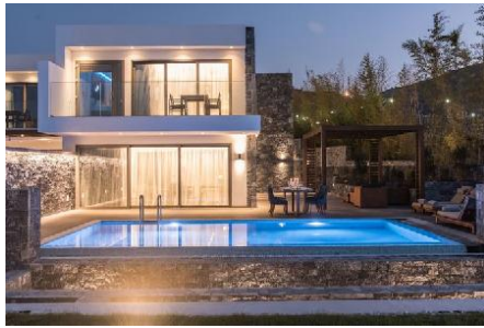
Grand Royal Villa

Lat: 35.30334268244559 Lng: 25.41858473318704