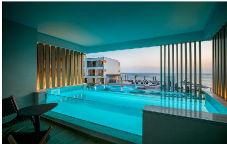
Superior Room Sea View Private Pool