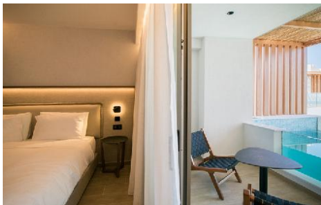
Standard room with Private pool

With king size bed or twin bed, sofa bed as extra bed, balcony, heating (individually adjustable), kettle (for free), minibar (for a fee), capsule coffee machine (for free), internet (for free), safe (for free) and flat screen sat TV as well as individually adjustable air conditioning. Bathroom with shower (room size: 25 m 2 ).