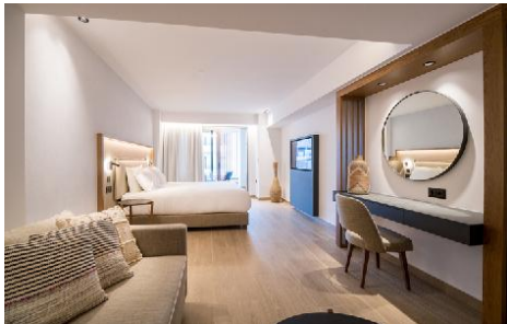
Standard room with Jacuzzi