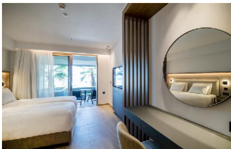
Superior Sea View with Jacuzzi