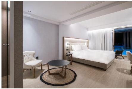
Standard Room City View Private Pool