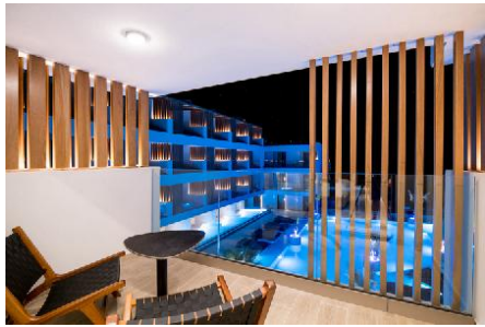
Superior Room Sea View