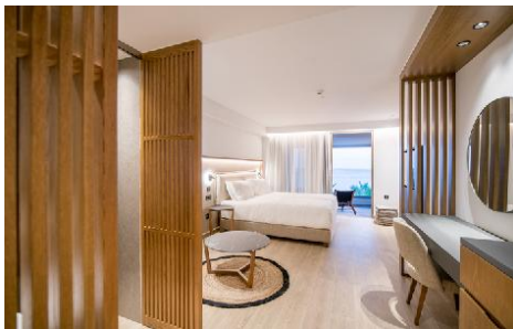
Superior Room Sea View