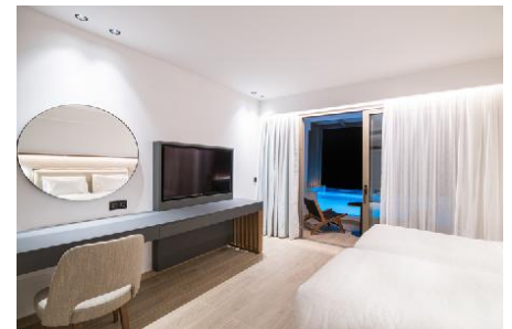
Superior Room Sea View Private Pool