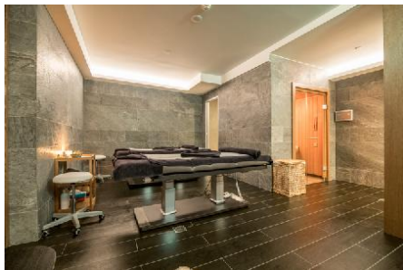
Spa and wellness