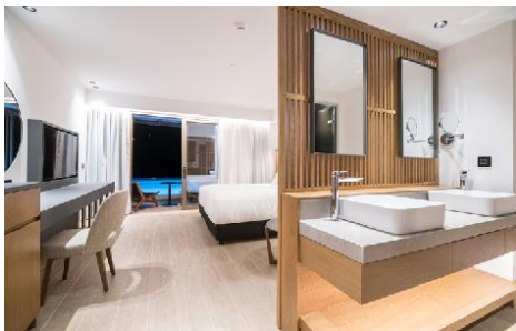
Superior Room Sea View Private Pool