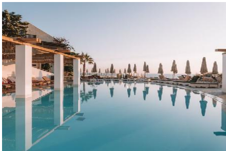
Pool with Pool Bar