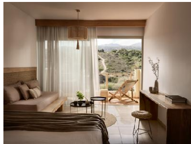
Double Standard Room