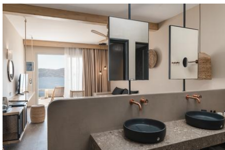
Double Room (SeaView)