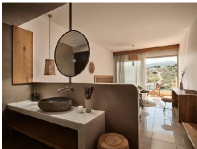
Double Room (LateralSeaView)