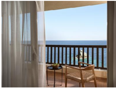
Life Style Suite (SeaView)

Lat: 35.41816100343718 Lng: 25.01874342096226