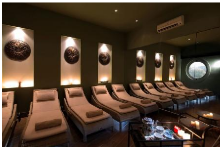
Spa and wellness