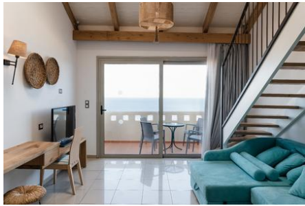
Loft Suite (Private Pool )

Lat: 35.41816100343718 Lng: 25.01874342096226