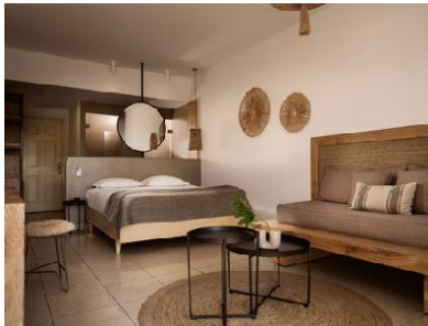
Suite (LateralSeaView, SwimUp-PoolTerrace)