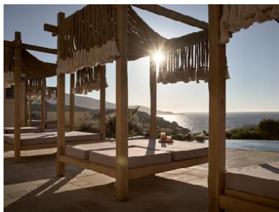
Sunset Room (SwimUp-PoolTerrace)