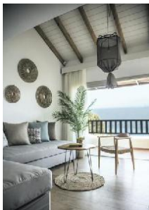
Loft Suite (SeaView)