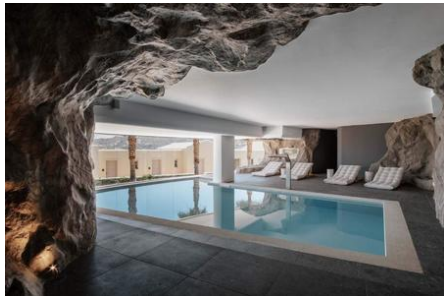
Spa and wellness