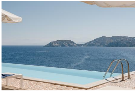
Suite (SeaView, SwimUp-PoolTerrace)

Lat: 35.41816100343718 Lng: 25.01874342096226