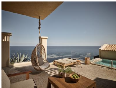
Suite (SeaView, Private Pool)