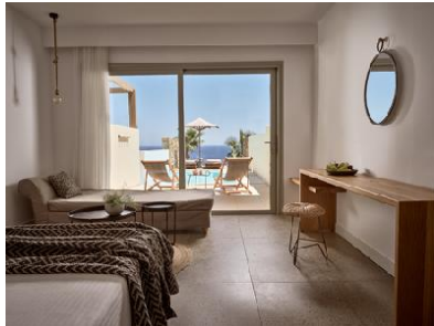
Superior Room (SeaView, Private-PoolTerrace)