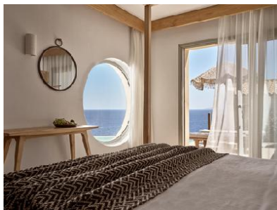
Suite (SeaView, Private Pool)