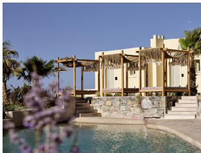
Sunset Room (SwimUp-PoolTerrace)