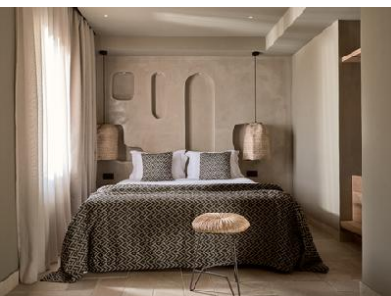
Life Style Suite (Mountain View)