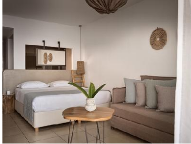
Double Standard Room

Lat: 35.41816100343718 Lng: 25.01874342096226