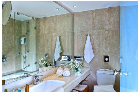
Double Standard Room