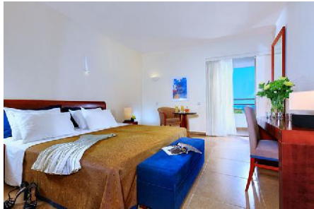
Double Standard Room