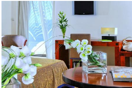
Double Standard Room