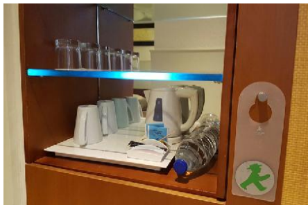
Double Standard Room