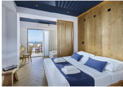
Double Superior Room (Sea or Pool View)