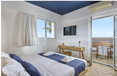
Superior FamilyRoom (Sea or Pool View, Balcony or