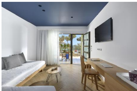
Superior FamilyRoom (Sea or Pool View, Balcony or