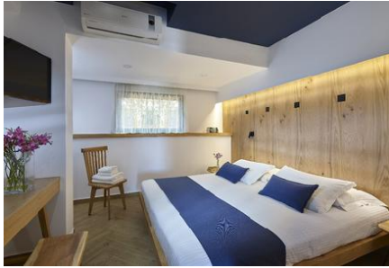
Double Superior Room

Lat: 35.30292099240162 Lng: 25.419116565290437