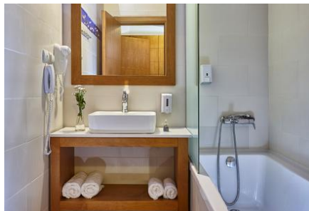
Double Standard Room