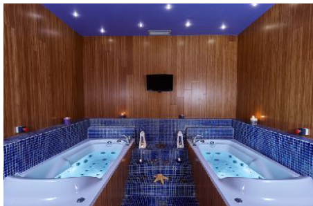
Spa and wellness