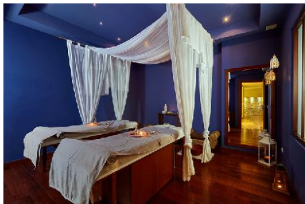
Spa and wellness