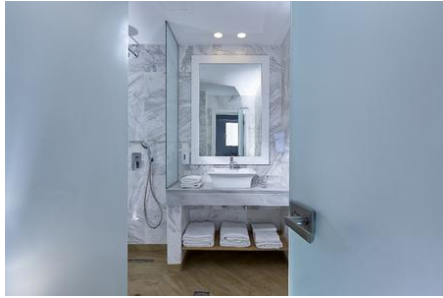
Superior FamilyRoom (Sea or Pool View, Balcony or

Lat: 35.30292099240162 Lng: 25.419116565290437