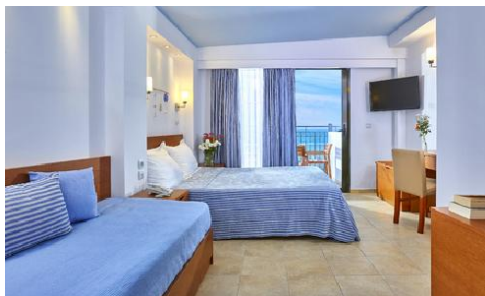
Double Standard Room