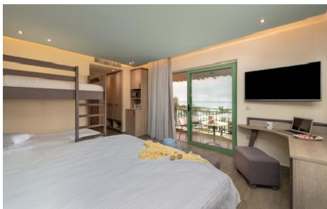
Standard Room (SeaView)