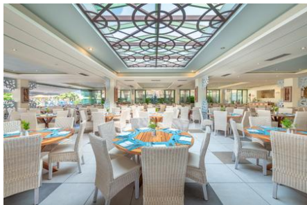
Restaurant MAIN MINOS