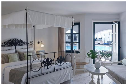
Deluxe Room Pool Front