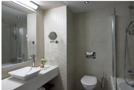
Deluxe Room Bathroom