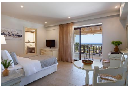
Deluxe Room Sea View