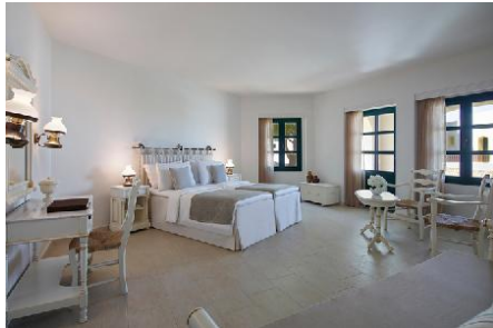
2 Connecting Rooms Standard Family Room