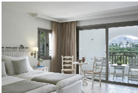
Deluxe Room Mountain-Garden View