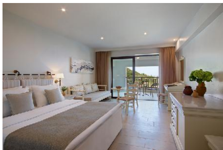
Standard Family Room Open Plan