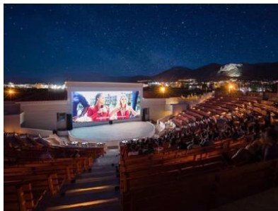
Open Air Cine Creta Maris