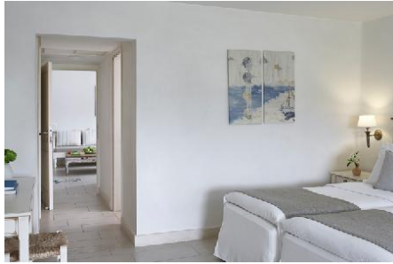
1 Bedroom Family Room

Lat: 35.323926292517235 Lng: 25.386603043740585