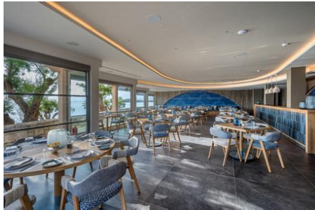
Adults only ALATSI Sea food