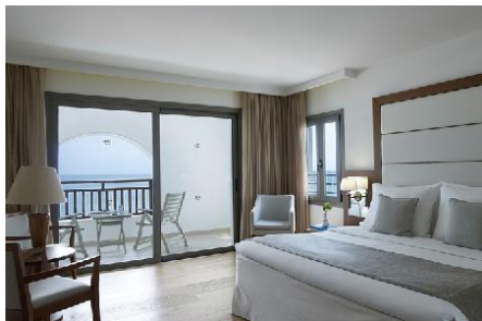
Suite Sea View