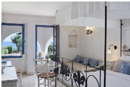
Deluxe Room Sea Front