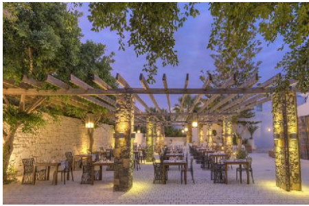
The Taverna Dining Restaurant

Lat: 35.33423378456494 Lng: 25.31825430187891