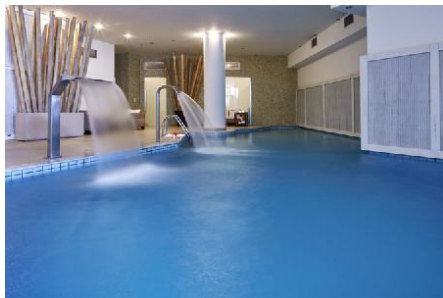
The Bathhouse, Spa Indoor Pool