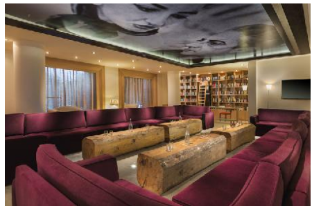
Veranda Lounge Bar