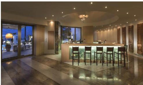
Tholos Bar Indoor