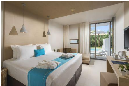
Double Standard Room (Shared_PoolTerrace) _2_opt