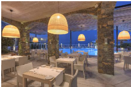
The Stone Lunch Restaurant