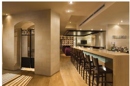
Veranda Lounge Bar