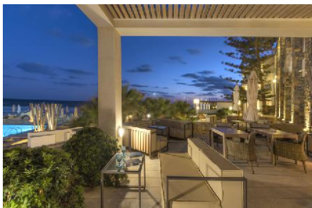
Veranda Bar Outdoor

- Door Width 190 cm - Door Width 100 cm Lift - Lift Depth 142 cm - Wheelchair Suitable - Lift Width 100 cm