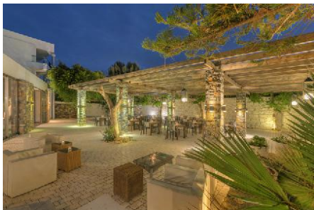
The Taverna Dining Restaurant