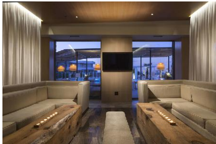
Tholos Bar Indoor