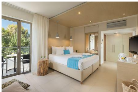
Standard Room (GardenView) _1_opt

Lat: 35.33423378456494 Lng: 25.31825430187891