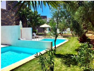
Double Standard Room (Shared_PoolTerrace) _1_opt

Lat: 35.33423378456494 Lng: 25.31825430187891