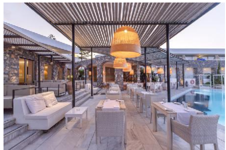
Tholos Bar Outdoor