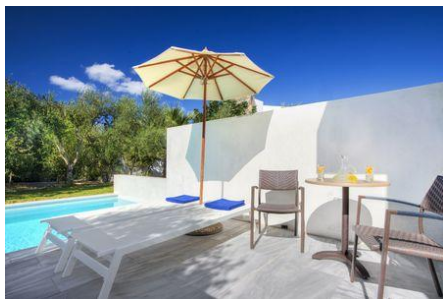
Double Standard Room (Shared_PoolTerrace) _3_opt