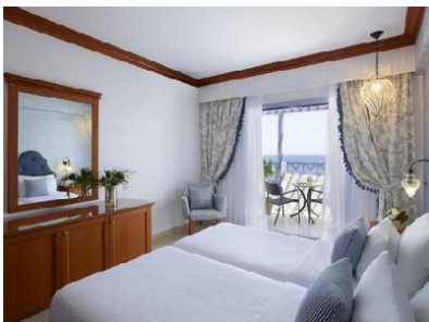
Superior Room (SeaView)