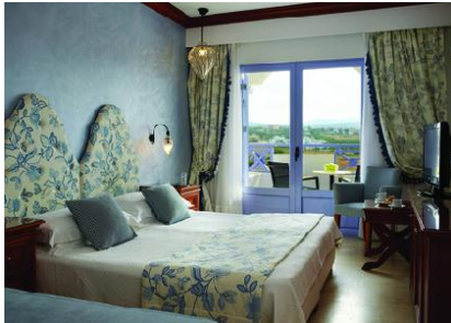
Double Standard Room (Inland View)