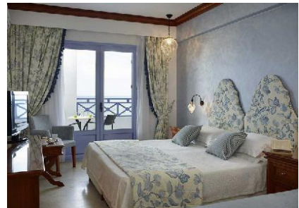
Double Standard Room (SeaView)