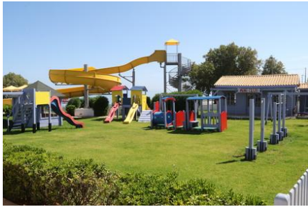
Playground and Mini Club