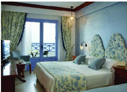
Double Standard Room (SeaView)