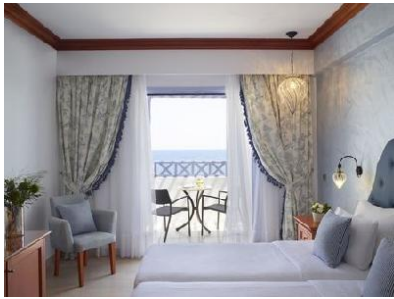
Superior Room (SeaView)